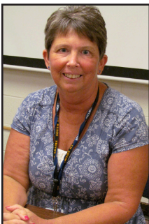
Anatomy & Physiology I Medical Terminology